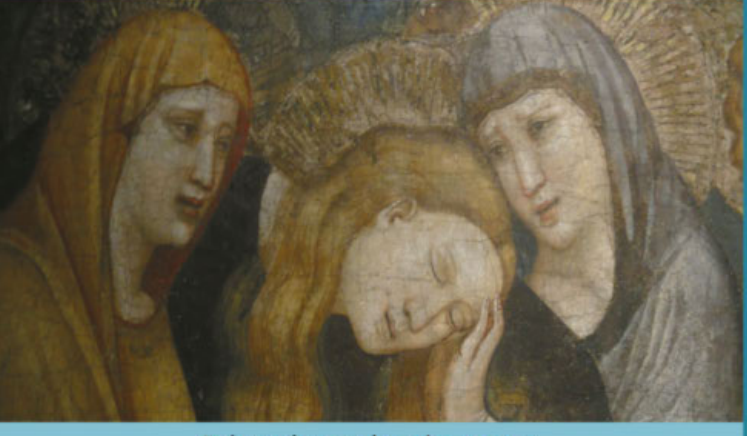
Join us in praying the rosary on the Feast of the Annunciation as we reflect on the Sorrowful Mysteries with prayerful intention & engaging Imago Divina.